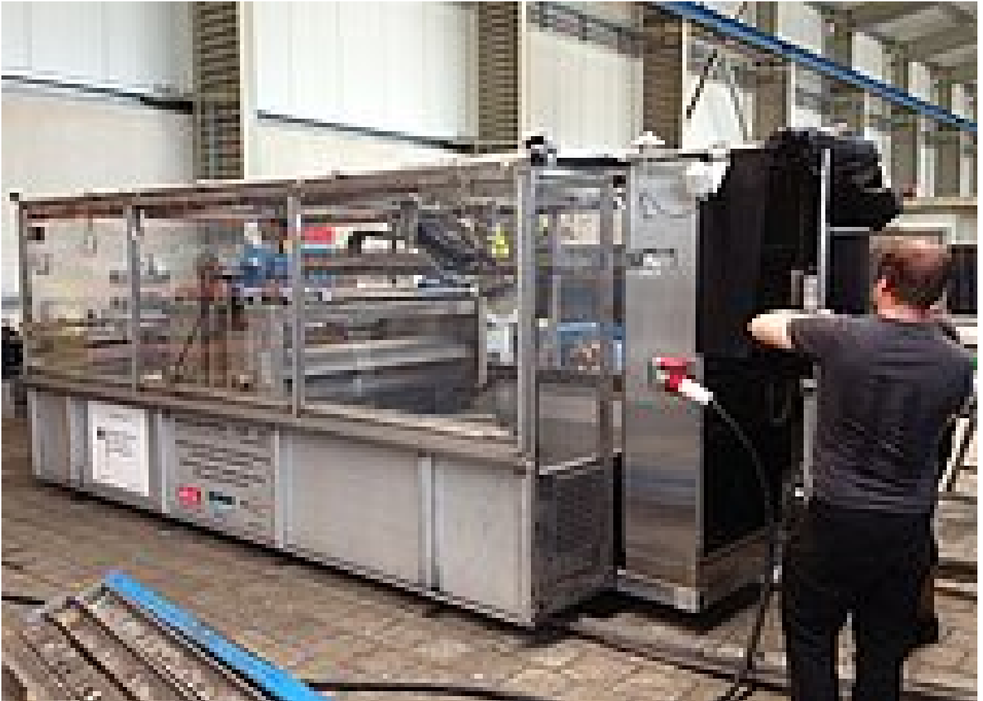
Comeback of the baby solar dryer: inspection of the electrical control system in the HUBER service factory