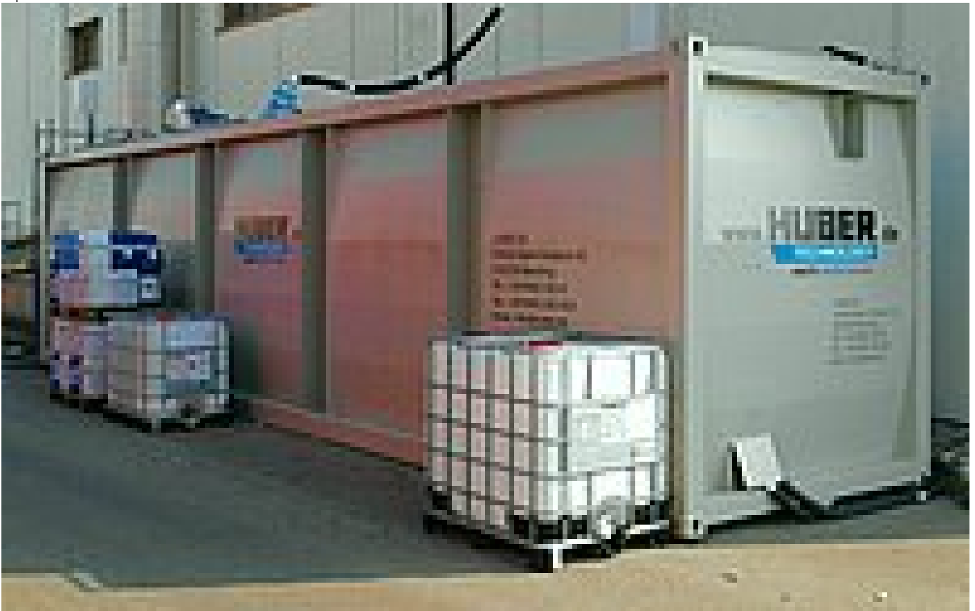
Containerised test plant at Erdinger brewery