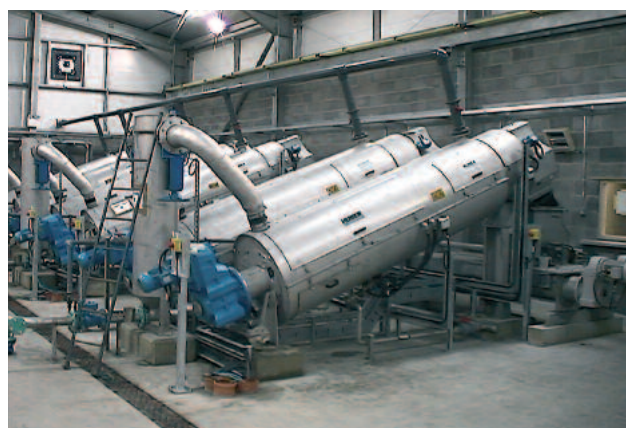
Parallel installation of six HUBER Screw Press S-PRESS units