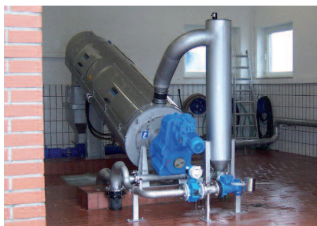
HUBER Screw Press S-PRESS for 8 m 3 /h