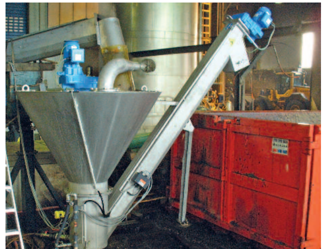
Special design for the treatment of sediments from biogas plants