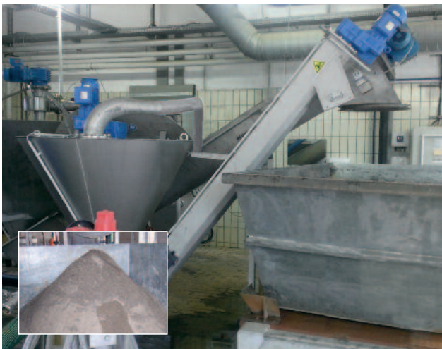
Grit washer installation on a municipal sewage treatment plant