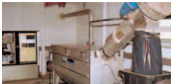
ROTAMAT® Sludge Acceptance Plant Ro 3.1 with metering, customer identification and automatic sampling.

screenings press with all its benefits. The ROTAMAT® Fine Screen is extremely sturdy, able to deal with rocks and grit, and entirely made of stainless steel. It is fully self-cleansing as its rake tines fully engage the basket bars. (Please find more detailed information in our separate Ro 1 brochure.)