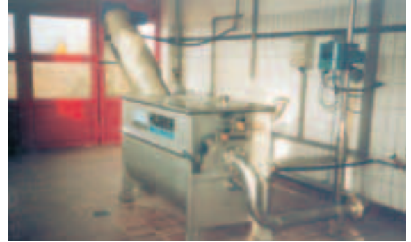
Indoor installation of a ROTAMAT® Sludge Acceptance Plant Ro 3

To meet these requirements HUBER developed special ROTAMAT® machines and plants that have proven their efficiency and reliability in hundreds of installations. After its mechanical treatment the septic sludge is either fed directly into a digester, pumped into a storage tank or discharged directly into the inlet of the WWTP.