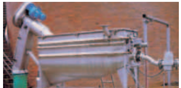
ROTAMAT® Sludge Acceptance Plant with subsequent grit trap

A subsequent grit trap is required where the septic sludge is not blended with raw wastewater and therefore does not flow through the grit trap of the WWTP. A combined unit, as shown in the photo, is available for this application. There are two installation options: The grit trap can either be installed below (see photo) or subsequent to the Sludge Acceptance Plant. This type of grit trap, however, separates only coarse grit.