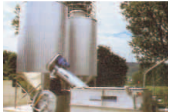
Thermally insulated balancing tanks allow continuous operation of the septic sludge treatment plant.