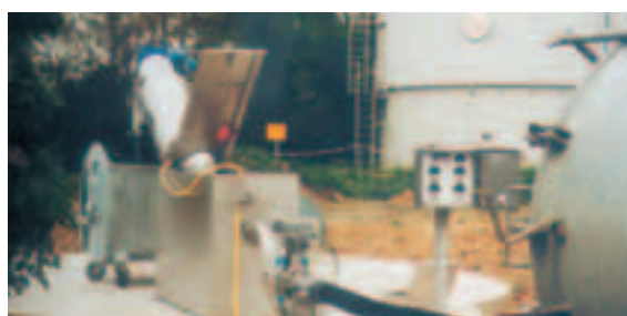
ROTAMAT® Sludge Acceptance Plant Ro 3.2 with integrated Micro Strainer, heating and insulation.

In this Ro 3 version the screen basket is cleaned by the stainless steel screw. Additional cleaning is achieved by wear-resistant brushes fitted to the screw flights.