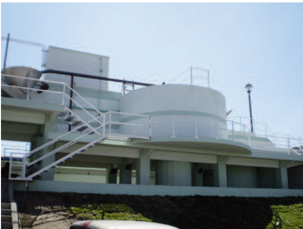
HUBER Vortex Grit Chamber VORMAX installation with HUBER Grit Classifier RoSF3